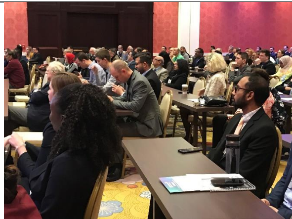
Full Sessions Everywhere!