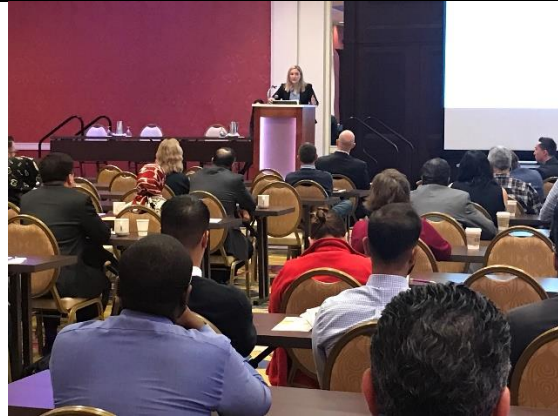
Professors In Action