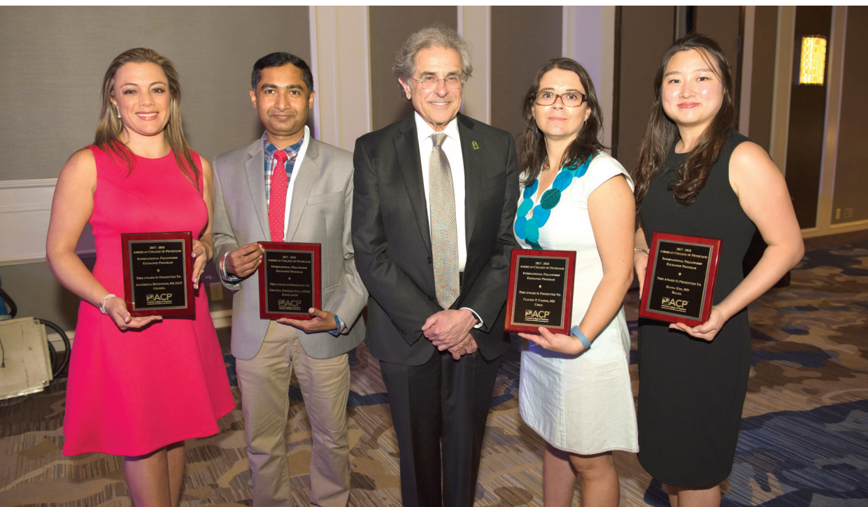
International Fellowship Exchange Program Awardees at Internal Medicine Meeting 2018