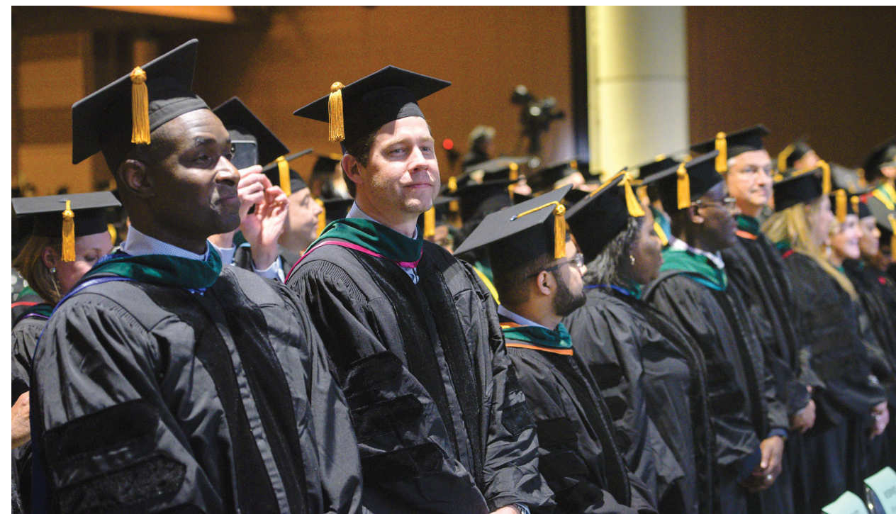
Convocation at Internal Medicine Meeting 2018