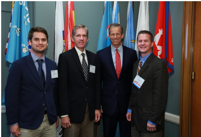
Members of the South Dakota ACP chapter delegation and Senator John Thune (R-SD).