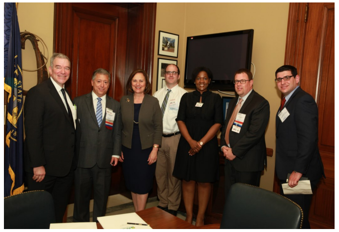
Members of the Nebraska ACP chapter delegation and Senator Deb Fischer (R-NE) .