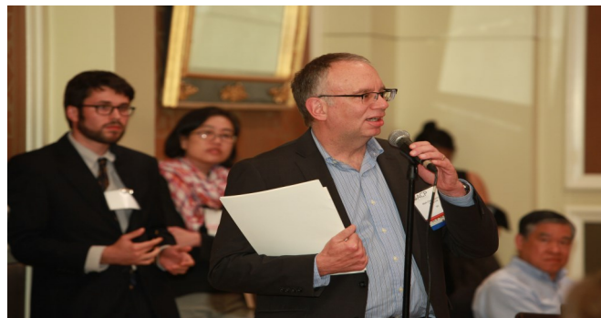
Leadership Day attendees posed questions during panel discussions.