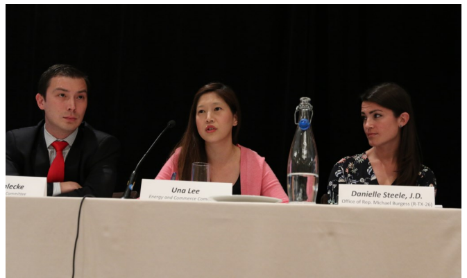
Participants on the "Health System Reform Phase II— From the Affordable Care Act to the American Health Care Act and More!" panel.