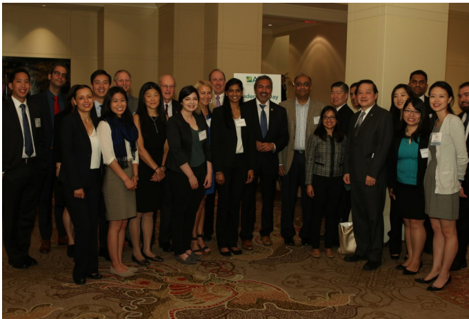
Members of the California chapter delegation with Rep. Ami Bera (D-CA).