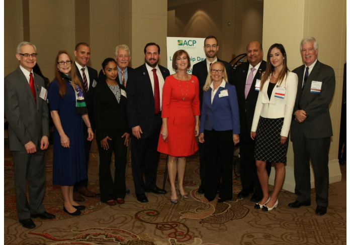
Members of the Florida chapter delegation with Rep. Kathy Castor (D-FL).