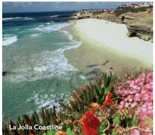
La Jolla Coastline

With 70 miles of beautiful beaches, countless parks and gardens, and endless opportunities for pampering at one of the area's many spas and resorts, San Diego is an excellent destination for some quality R&R. There are infinite options for activities to enjoy, regions to explore, and attractions to visit.