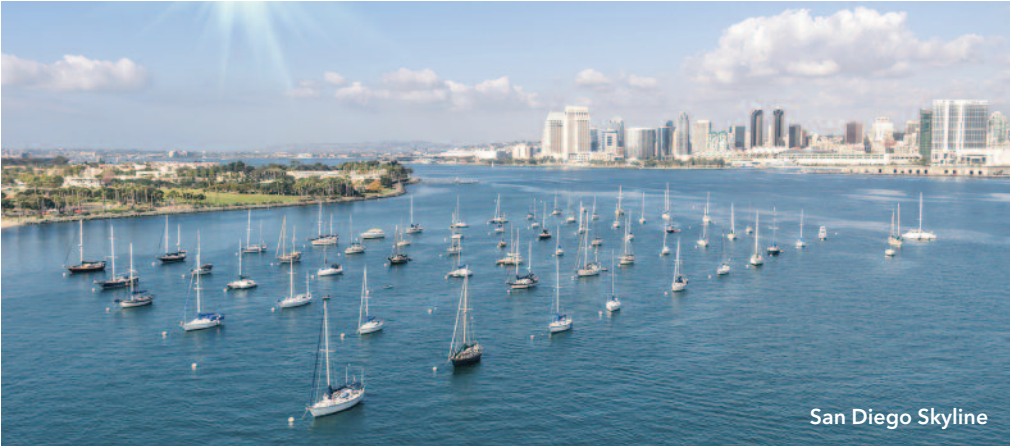
San Diego Skyline

San Diego offers every kind of activity imaginable. From world-renowned attractions, unlimited outdoor recreation, a thriving arts and culture community, sightseeing tours, and award-winning restaurants, you're sure to find a host of things to entertain and inspire.