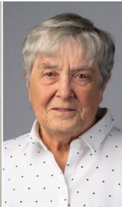
KRISTIN RIES, MD MACP CHAPTER ADVOCACY AWARD