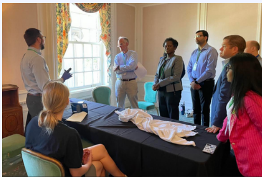
Attendees learning point of care ultrasound techniques