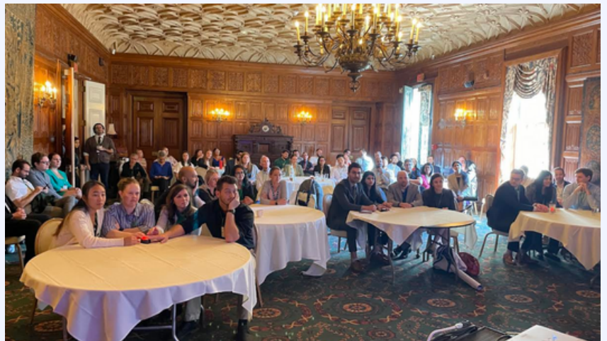
Residents from five Kentucky internal medicine residency programs competing in Doctor's Dilemma UK Bowling Green was this year's winning team and represent Kentucky at the national competition at IM 2024