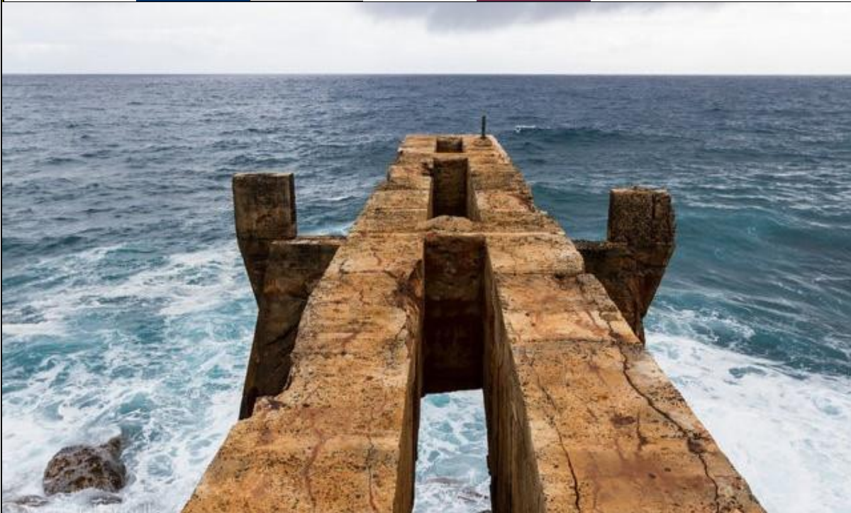
'Pineapple Dump Bridge'