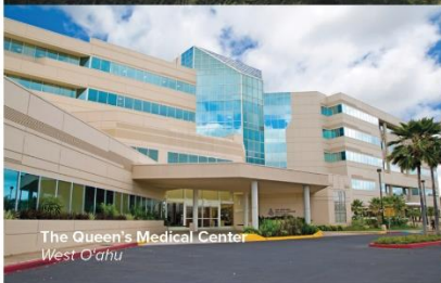
The Queen's Medical Center West Oahu