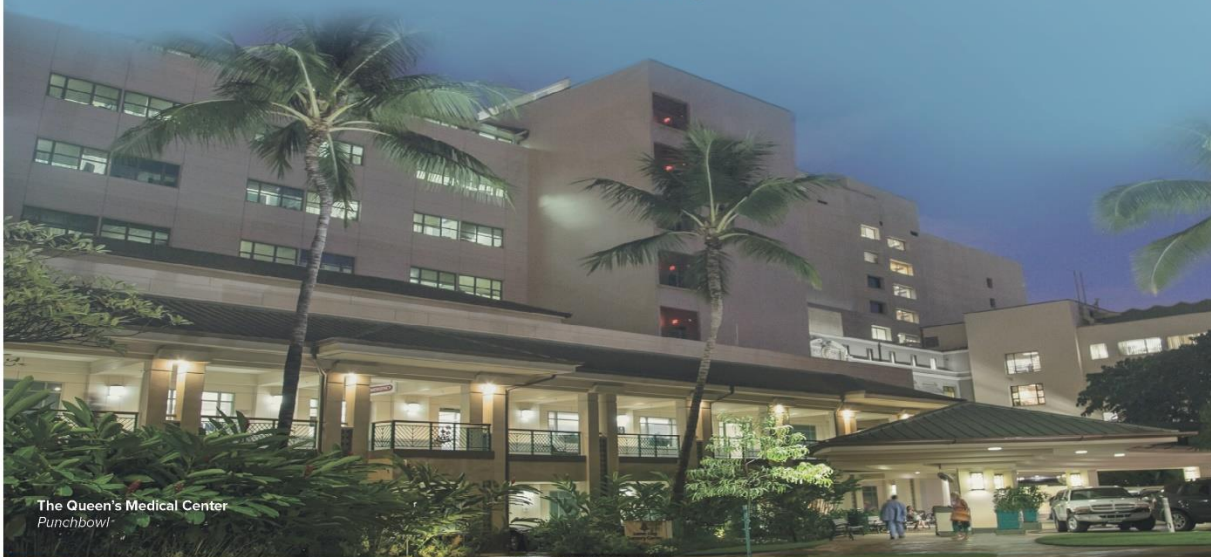
The Queen's Medical Center Punchbowl