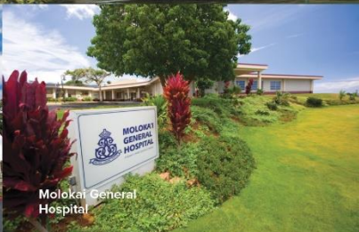
Molokai General Hospital