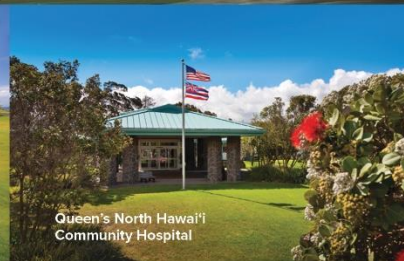
Queen's North Hawai'i Community Hospital