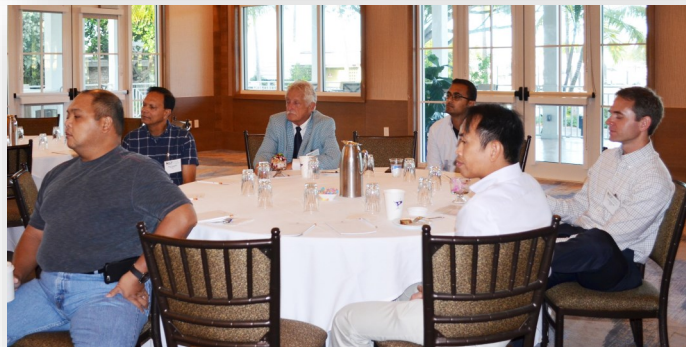
Fellowship Mentoring Breakfast