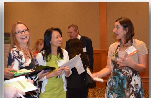
Judging the Poster Competition