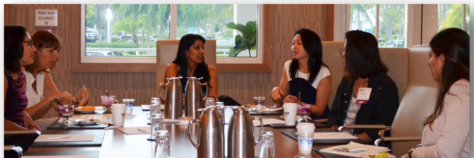
Women In Medicine Networking Breakfast