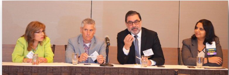
Program Director Panel at the Residents Breakout Session