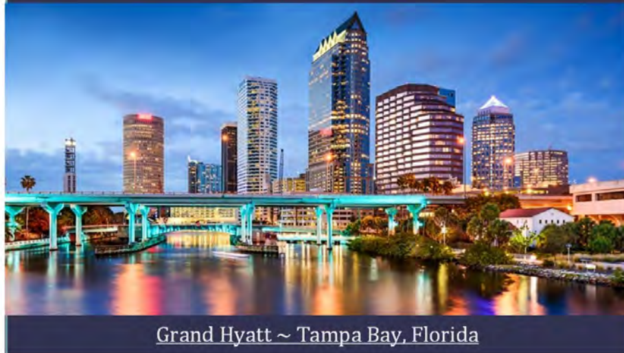
Grand Hyatt ~ Tampa Bay, Florida