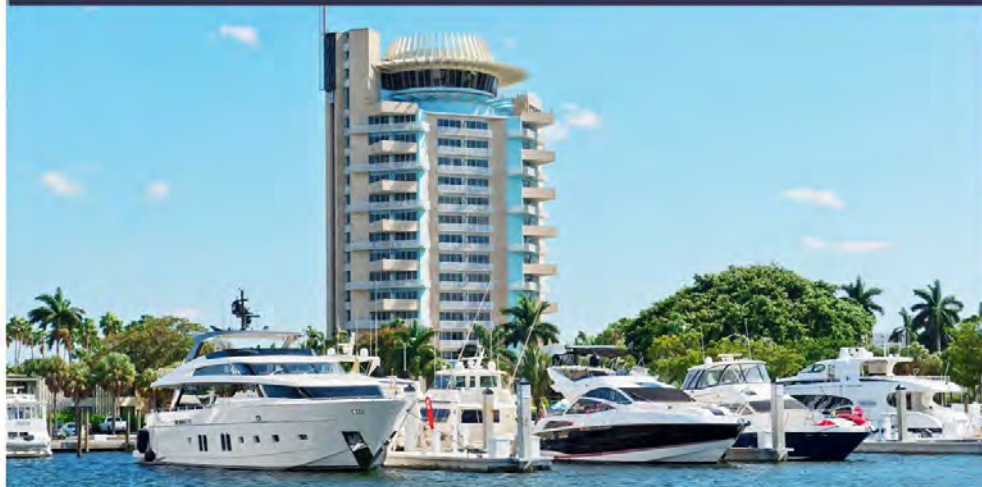
Pier Sixty-Six Resort & Marina ~ Ft Lauderdale, Florida