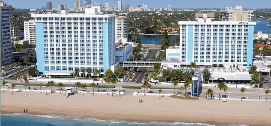
The Westin Ft Lauderdale Beach Resort