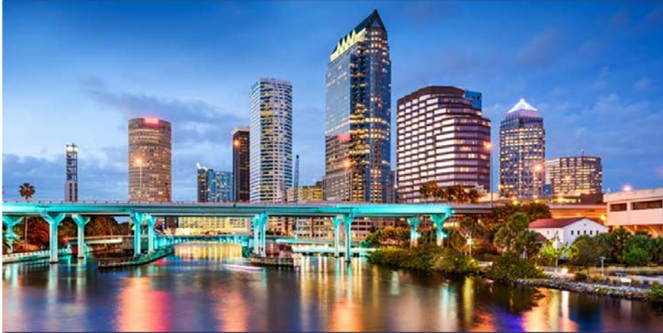
Grand Hyatt ~ Tampa Bay, Florida