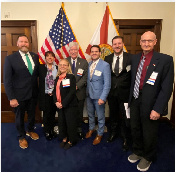
Congressman Aaron Bean meets with the Florida Delegation