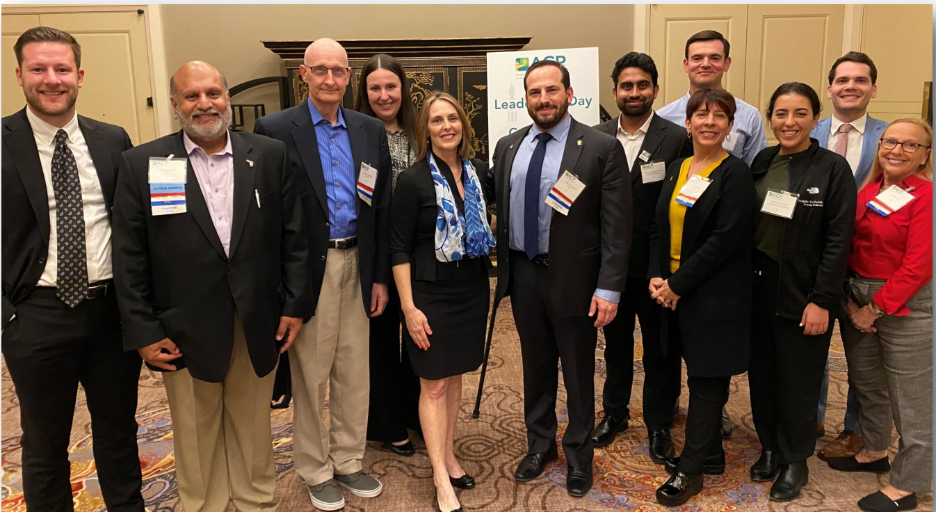
Florida Delegation congratulates Congresswoman Kathy Castor on receiving the ACP Joseph F. Boyle Award for Distinguished Public Service