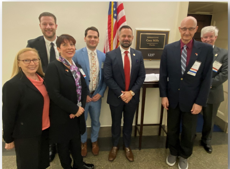
Congressman Cory Mills meets the Florida Delegation