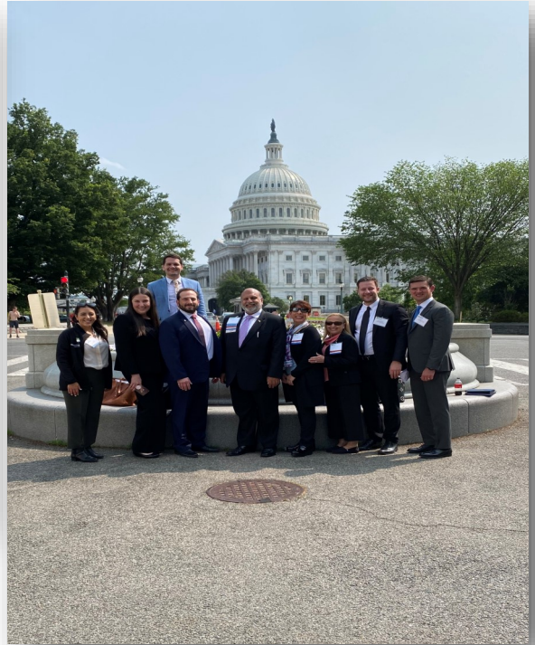
Successful Day on Capitol Hill