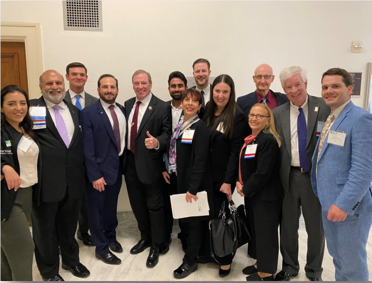
The Florida Delegation meets with Congressman Neal Dunn MD