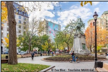
October 21-23, 2026 Montreal, QC

Registration will be available in June 2025 – stay tuned!