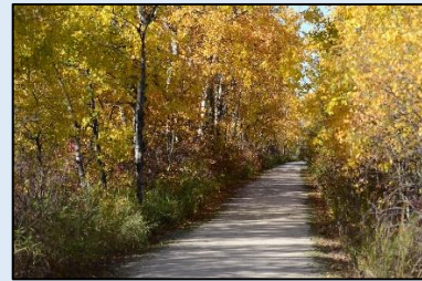
October 13-15, 2027 Winnipeg, MB