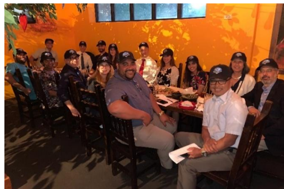
First Governor's Council Meeting LIVE!

Follow us on Facebook or Instagram at @acpsocalregion2