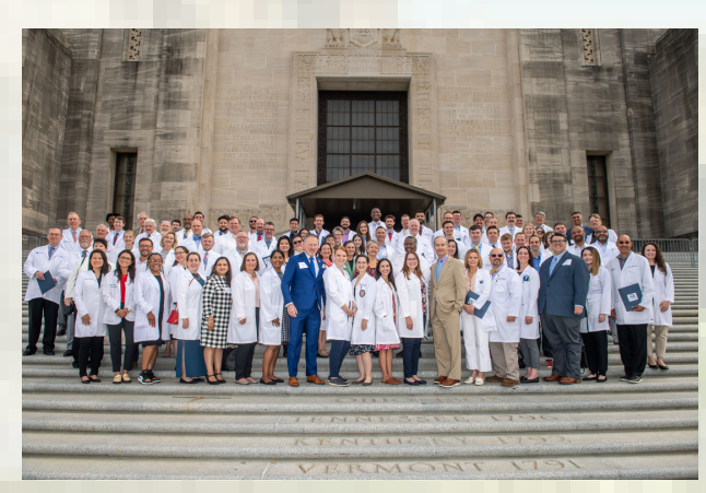
Louisiana physicians at the Capitol for 2023 WCW