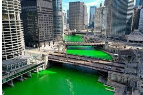
Chicago dyes the river ACP Green