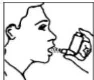
A. Open mouth with inhaler 1 to 2 inches away.