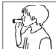
D. Note: Inhaled dry powder capsules require a different inhalation technique. To use a dry powder inhaler, it is important to close the mouth tightly around the mouthpiece of the inhaler and to inhale rapidly.