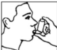
C. In the mouth. Do not use for corticosteroids.