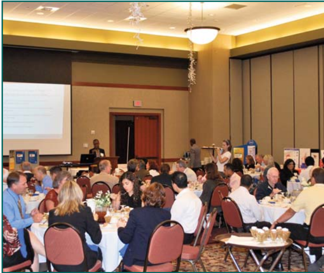
2008 Annual Meeting