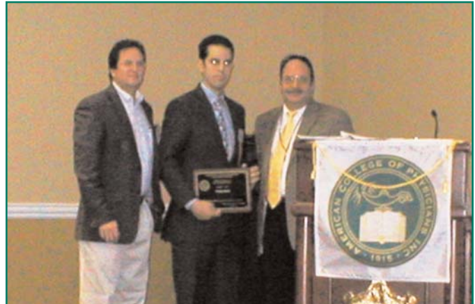
Clinical Vignette Winners