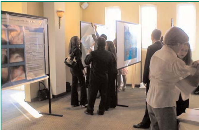
Clinical Vignettes preparation