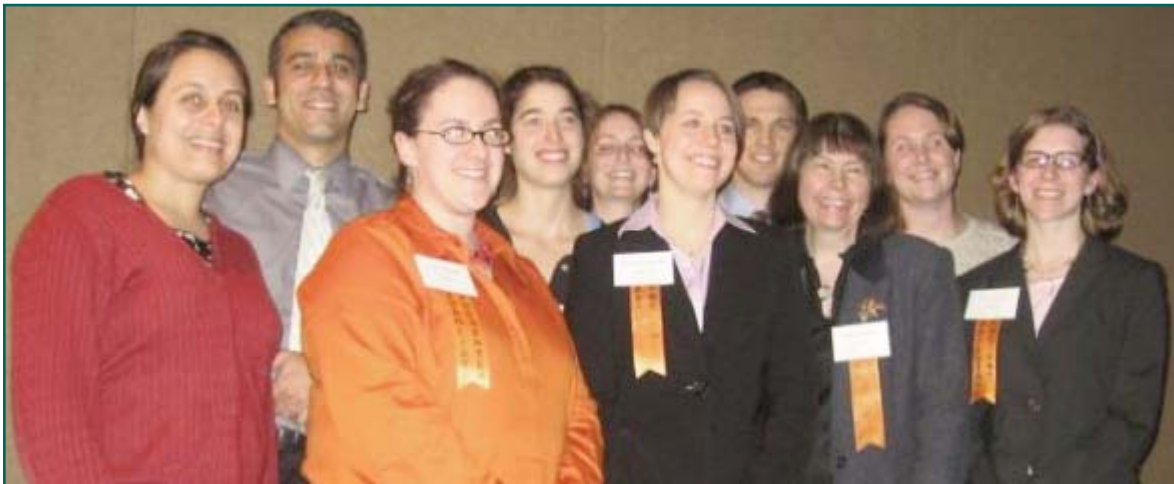
Associate Winners from 2008 Chapter Meeting