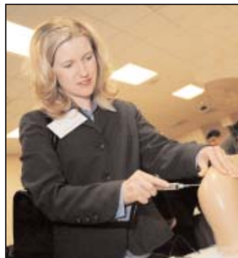
Abstract Presenters in Action