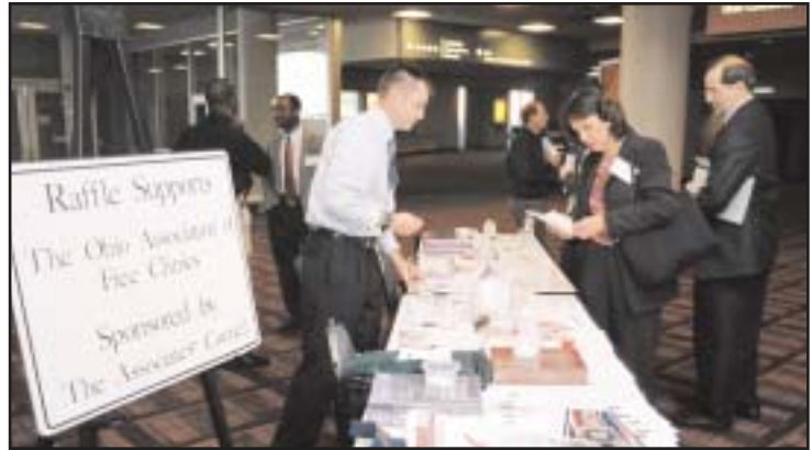
Associate Council host annual raffle to raise money for The Ohio Association of Free Clinics