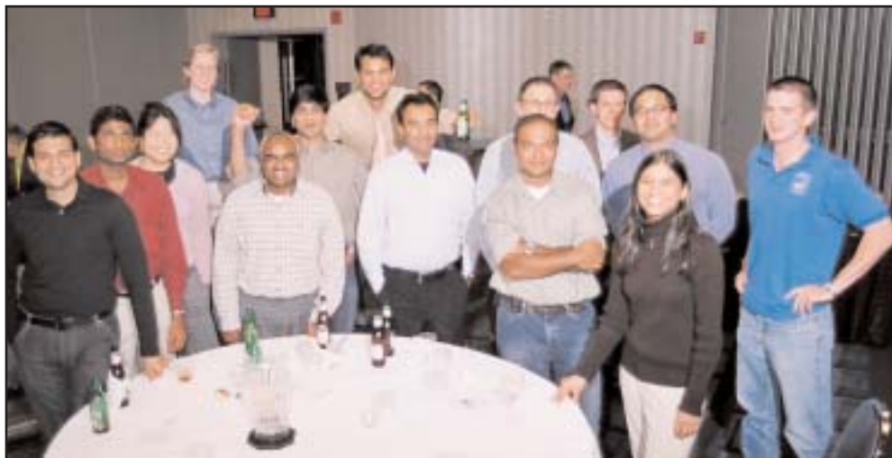
Winning team at The Annual Quiz Bowl, October 7, 2004

Make your voice heard, make our voice stronger become a Key Contact http://www.acponline.org/hpp/advocacy/index