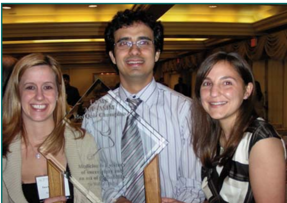
The Victorious Jeopardy Team