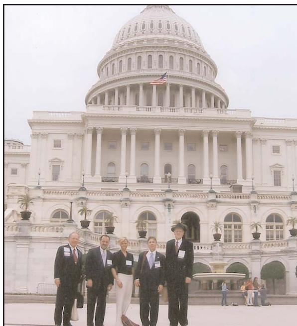
Kansas participants at Leadership Day on Capitol Hill."