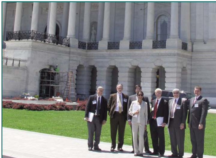
Iowa Delegation on front of capitol building

We met with the legislative staffs of all five Congressmen and both Senators. Everyone is interested in promoting health care reform, especially options for increasing incentives for primary care. The challenge is finding the money and the political will to make substantive changes. Your Senators and Congressman need to hear your opinions as well as ours. Since both houses of Congress plan to present legislation before the August recess, it is important that hear from you now