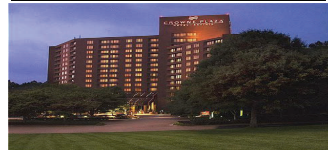
Crowne Plaza Ravinia Atlanta, GA