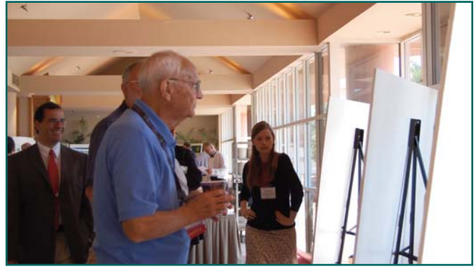
Medical Student Posters reviewed by meeting attendees and judges