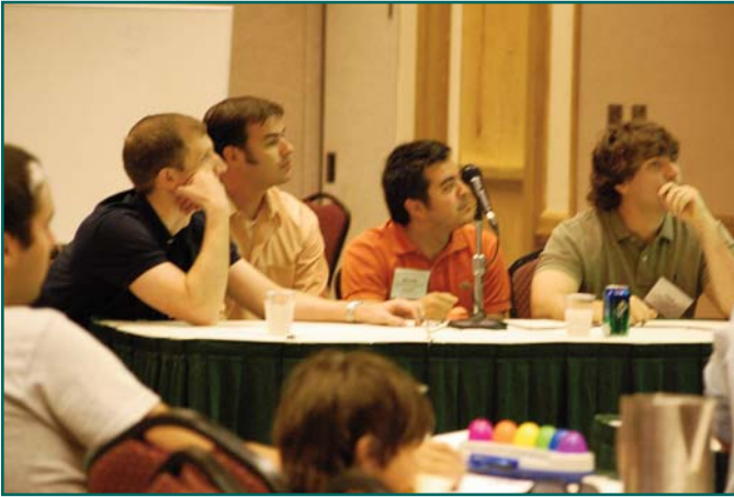
UAB Doctors Dilemma Team Heads to IM 2010 as this year's winners!