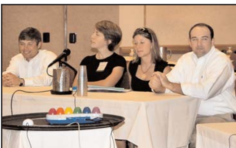
One of the 5 Medical Jeopardy Teams prepares for Competition