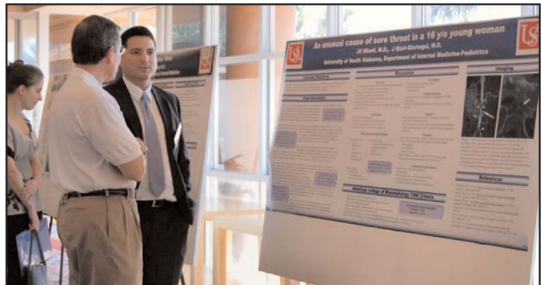
The first poster competition at the Alabama Chapter meeting proved to be a huge success!